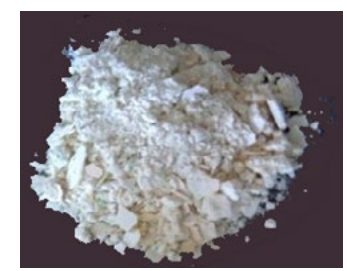
Aragonite , another form of calcium carbonate, has very different characteristics to calcite. When calcium carbonate precipitates as argonite it forms a non-adhering harmless insoluble crystal that is either consumed or carried through the system to the drain.